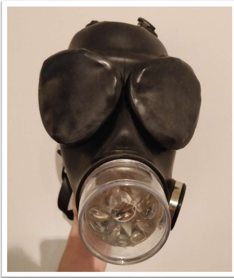
Only the lenses cover